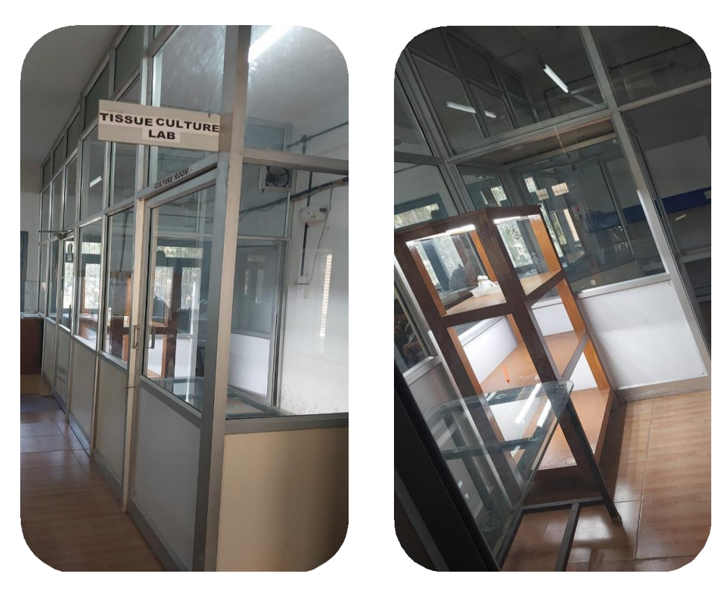
Botany Tissue Culture Laboratory