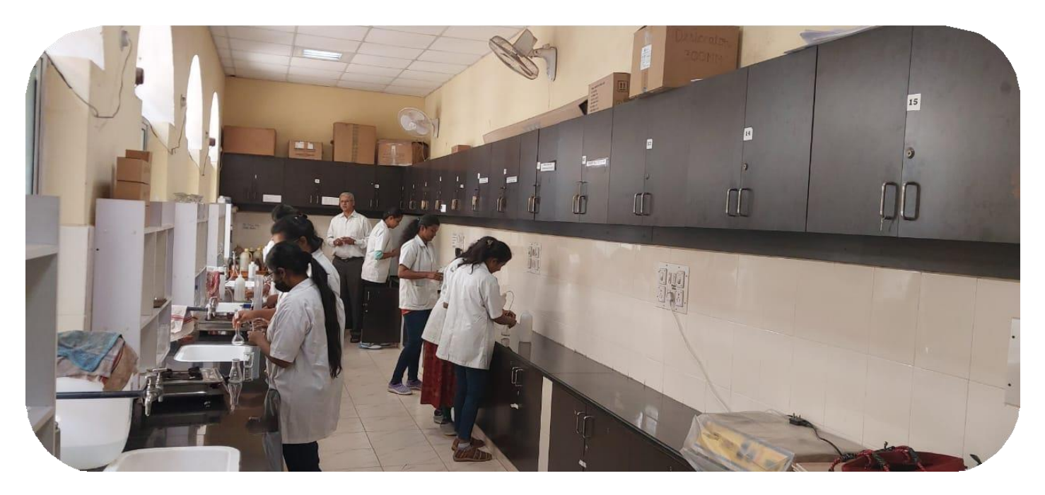
Food Science and Nutrition Laboratory